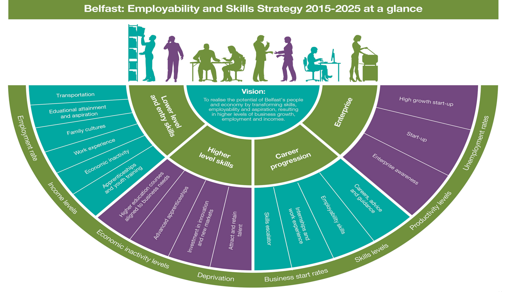
Figure 3: Belfast Employability and Skills Framework: Summary of vision, overarching aims and activity themes